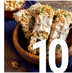
SNACKS & CONDIMENTS