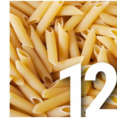
PREPARED & PACKAGED FOODS