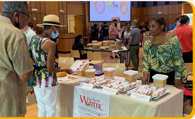
Attendees at the 2022 Food & Beverage Expo check out the products from a local food producer.