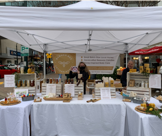
MoCo Made business