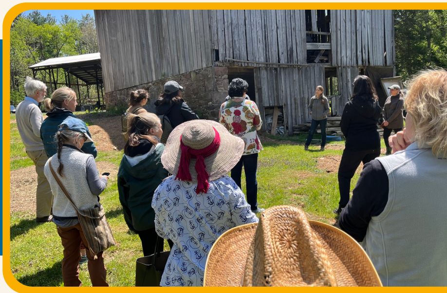
Button Farm Tour.