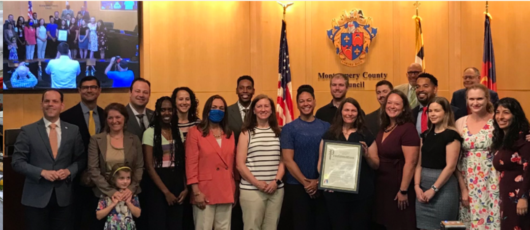
Food Council recognized with a proclamation at the Montgomery County Council