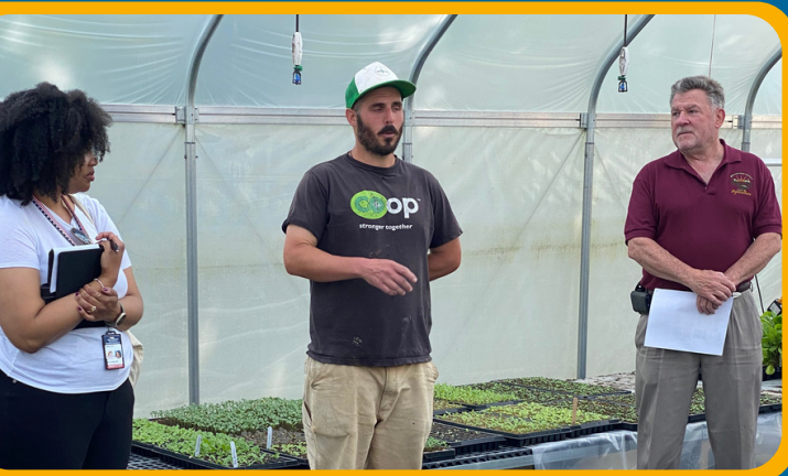
Agricultural Reserve tour photos.

In the Spring, Montgomery County Food Council Members, Working Group Members, staff, and elected officials enjoyed an informative tour of the Montgomery County Agricultural Reserve.