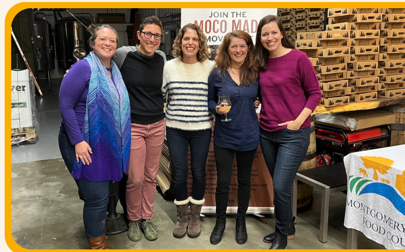
MoCo Made Happy Hour

There were 145 attendees engaged throughout the series including County representatives, community leaders and many other stakeholders.